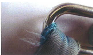
FRAYING AT CARABINER