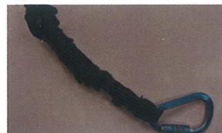
ALTERED OPA JACKET