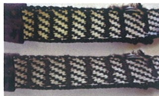
BLEACHED BARTACK COMPARISON: NORMAL VS BLEACHED