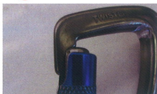
GATE ISSUE OR SHARP EDGE