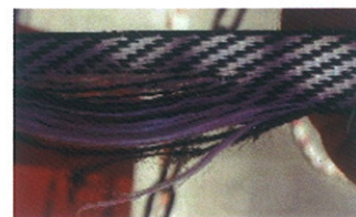
EXCESSIVE SIDE WEAR